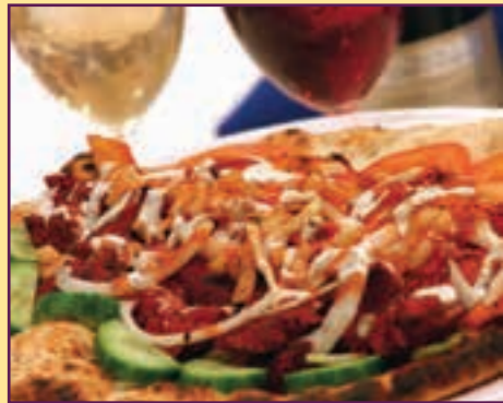
MIXED GRILL KEBAB